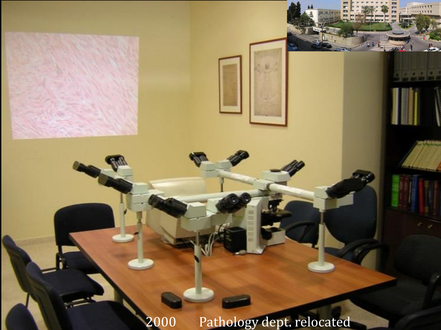
2000 Pathology dept. relocated