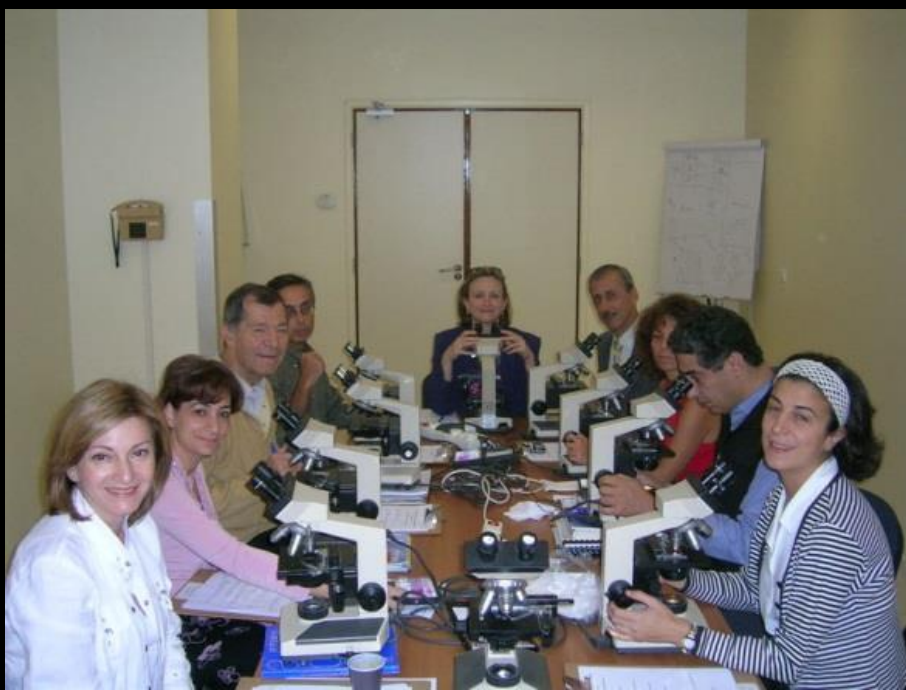
Pr Coindre Oct. 2005