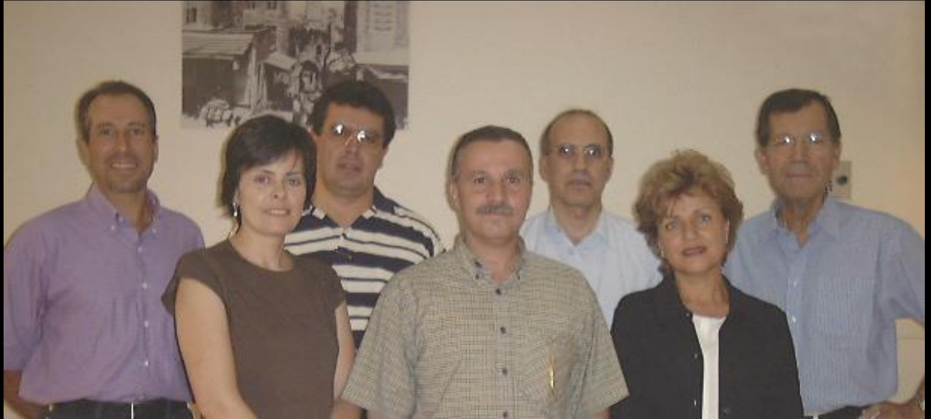
LSAP Committee 2000