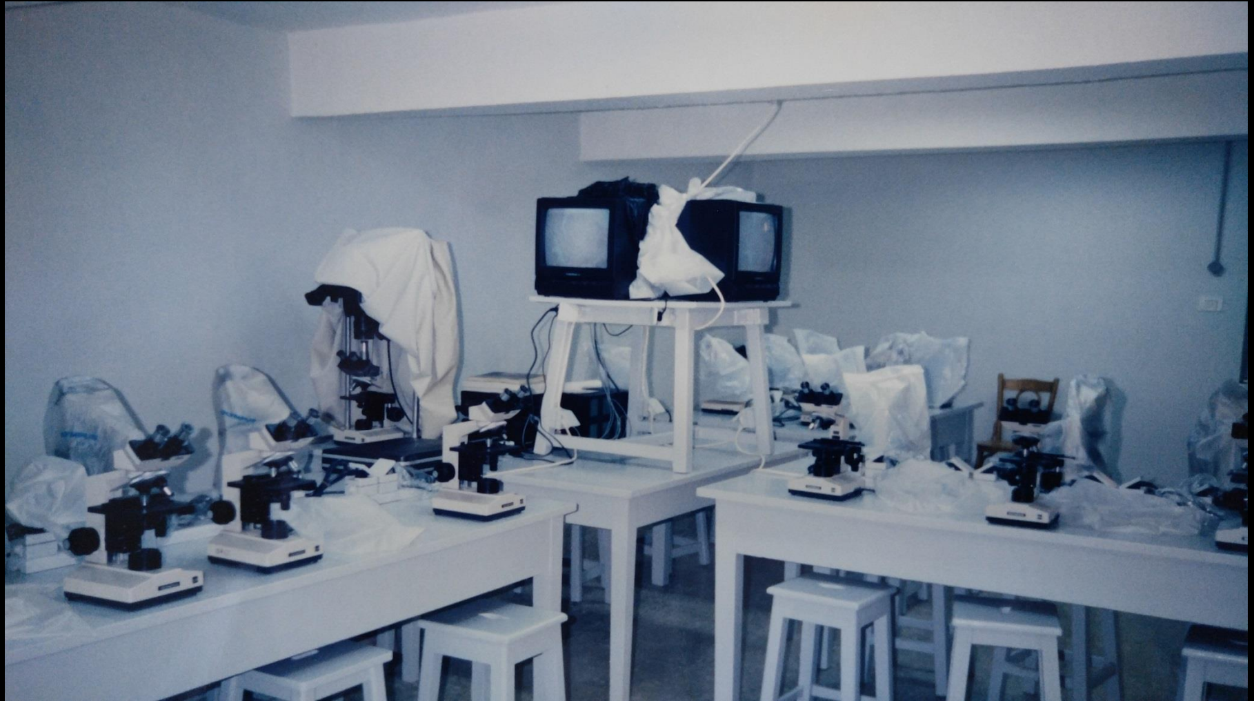
Rough times, teaching in underground parking lots